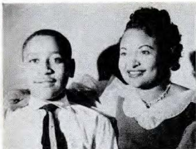
Mrs. Mamie Bradley and slain son, who was slated to enter 8th grade in Chicago this fall. He was her only child.

Aroused by America's first lynching in four years — the kidnaping and murder by three Mississippi white men of chubby, 14-year-old Chicagoan Emmett Louis (Bobo) Till because he whistled at a white woman — leaders of both white and Negro groups demanded